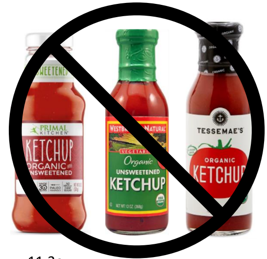
11.3oz Primal Kitchen