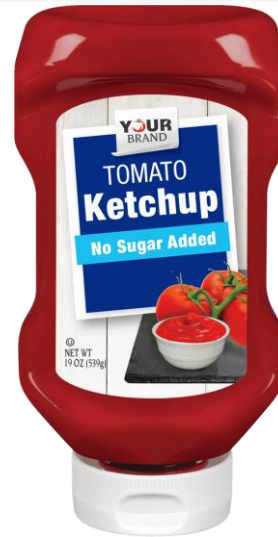
19oz YOUR BRAND No Sugar Added Ketchup