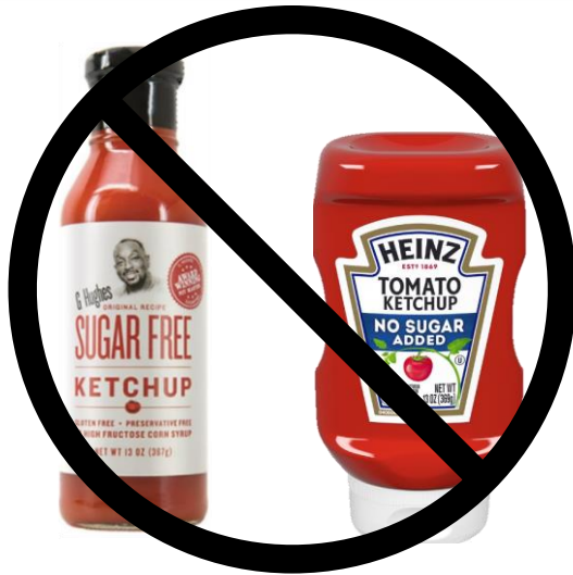
13oz G Hughes Sugar Free